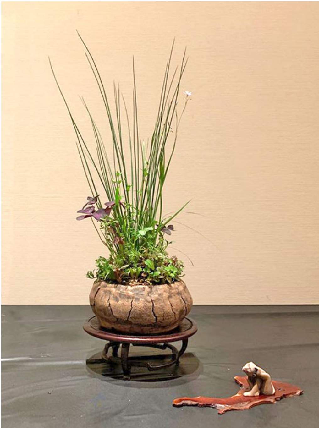
The "Transatlantic Friendship Kusamono" at the exhibition of the American Bonsai Society 2019 [1]